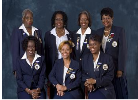
Board of Directors 2009 - 2010

Celebrating!!! Administrative Professionals Week